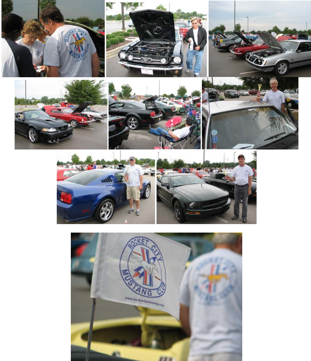
My favorite photo of all.....